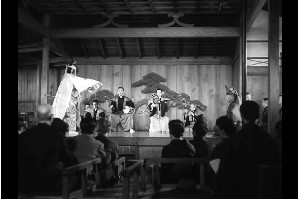
The Noh play 1

plying that his pursuit of happiness may not be essentially attached to hers. Moreover, by the end of this sequence, Ozu has once again managed to simultaneously incite and undercut or destabilise our conventional expectations concerning the behaviour of the main characters in this traditional setting. This reinforces the message that some traditional practices are slowly being emptied of their original force and purpose, at the verge of becoming mere ritualised repetitions – or perhaps forms of mourning a world already felt as lost.