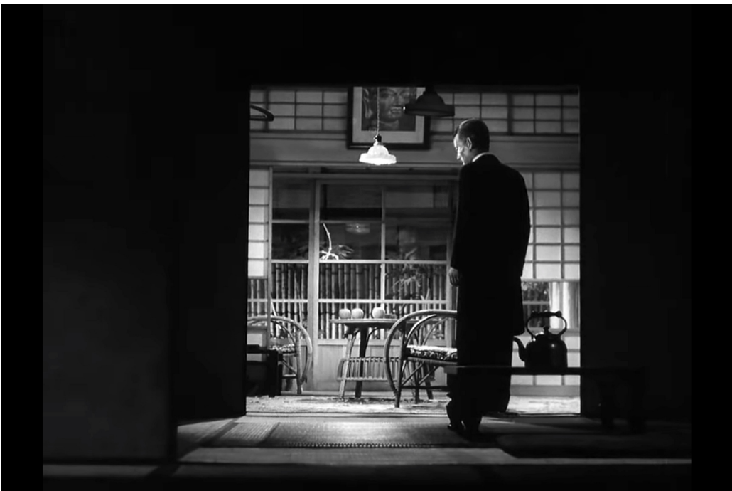
An epilogue 2