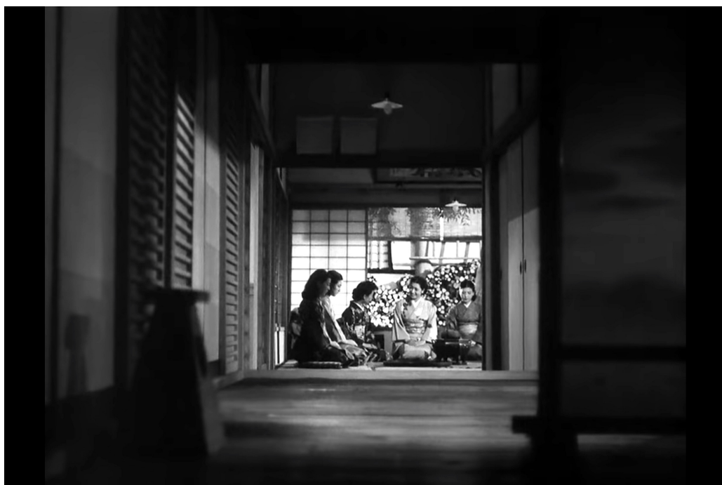
Noriko's introduction 1