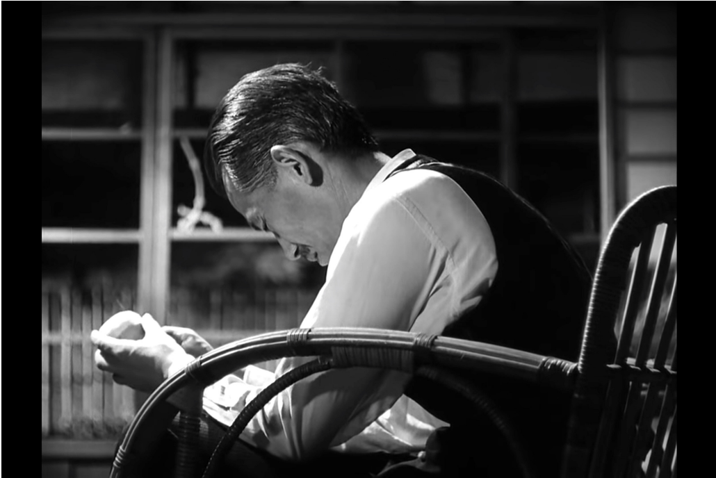
An epilogue 3