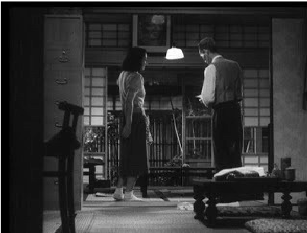
Noriko and Somiya's domestic world 2