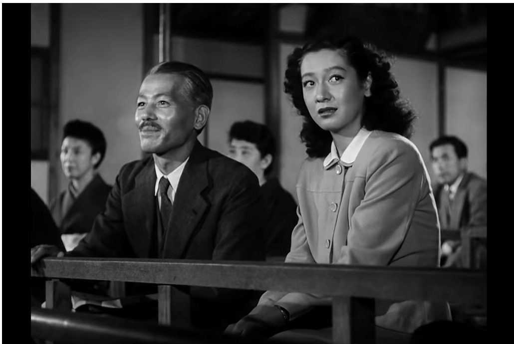
The Noh play 3