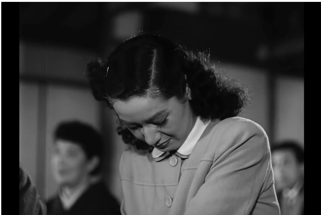
The Noh play 5