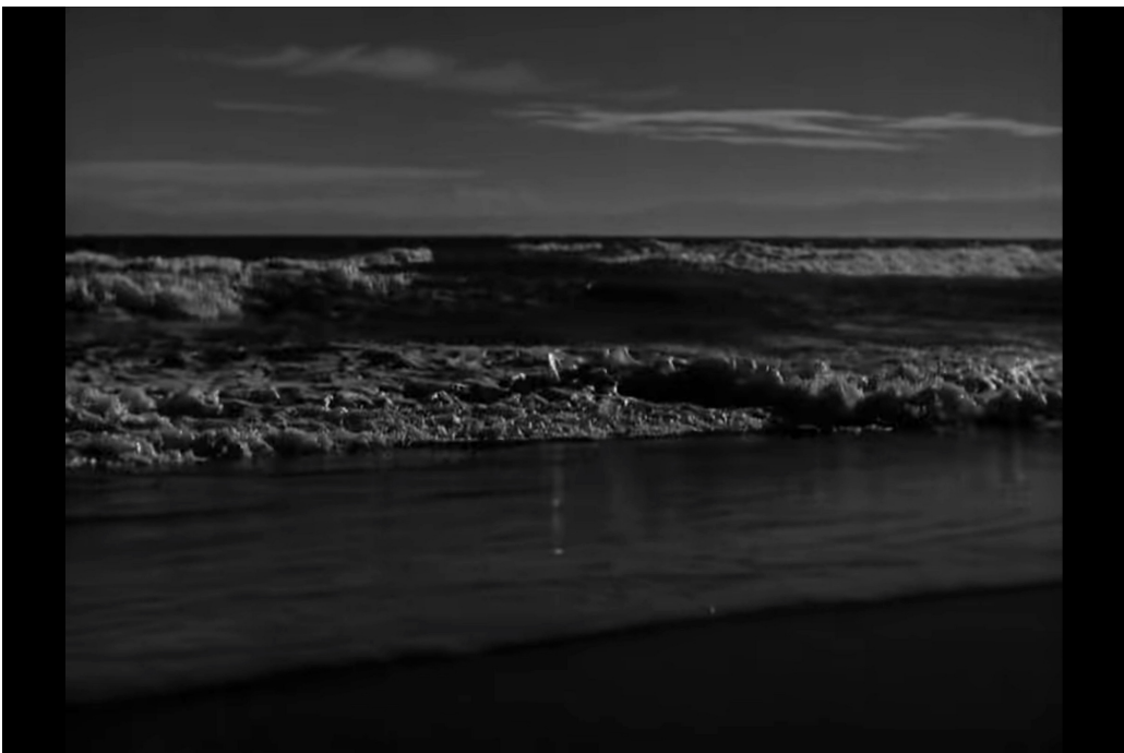
An epilogue 4