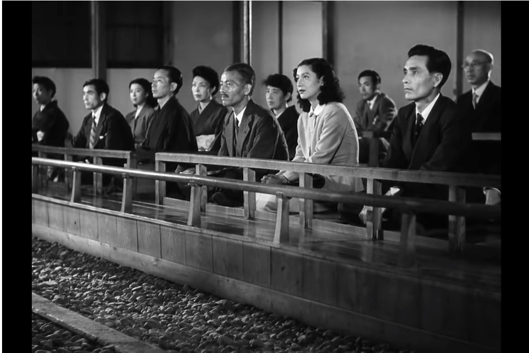
The Noh play 2