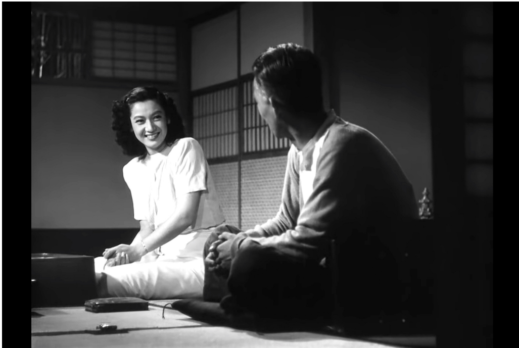
The trip to Kyoto 3

couldn't make me happier. . . . You marry if you want to Father. I just want to be by your side. I'm so fond of you. Being with you like this is my greatest happiness. Please Father, why can't we stay just as we are? I know marriage won't make me any happier.