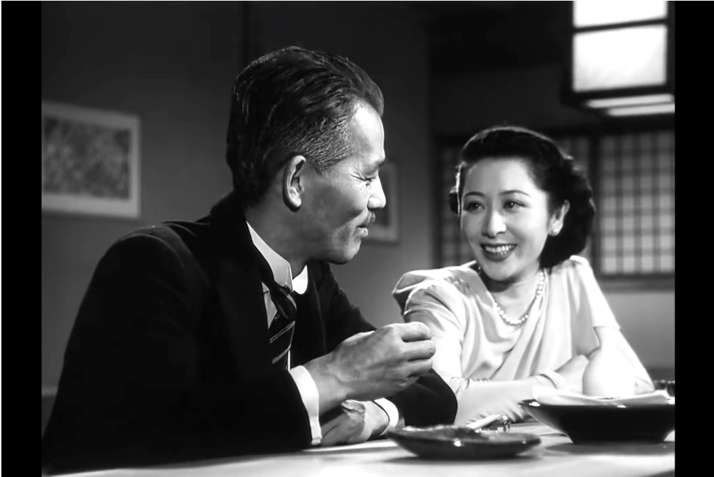
An epilogue 1