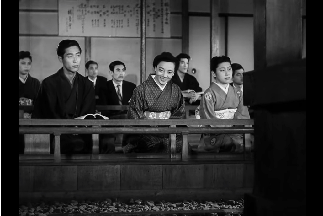
The Noh play 4