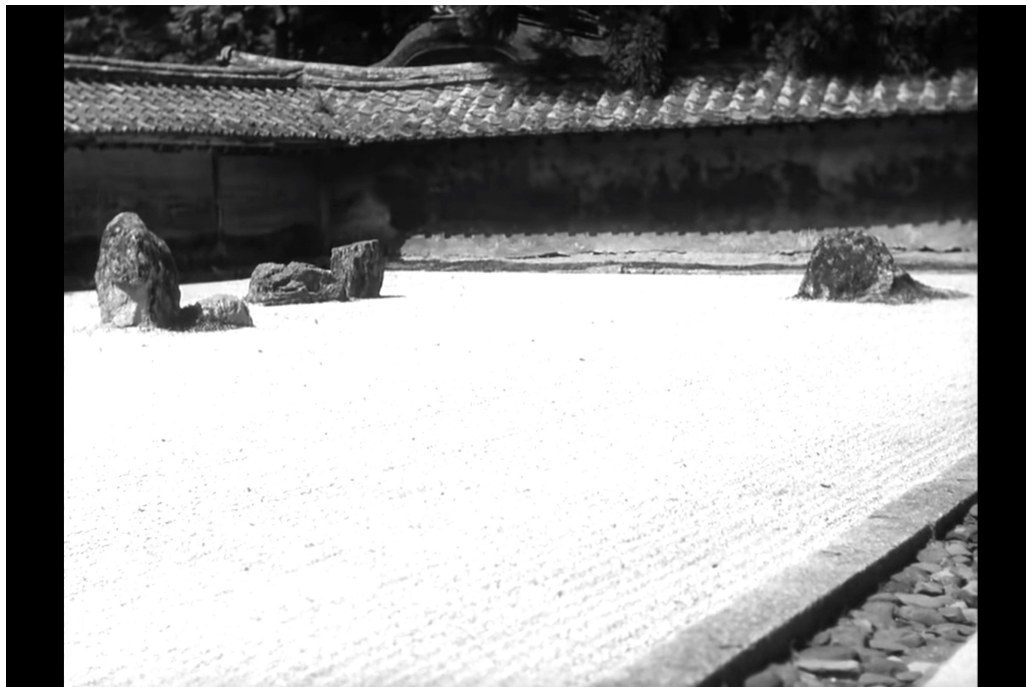
The trip to Kyoto 1