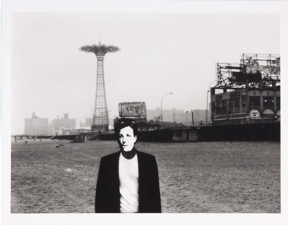
Figure 5: Arthur Rimbaud in New York (Coney Island), David Wojnarowicz, 1978-79, silver print.