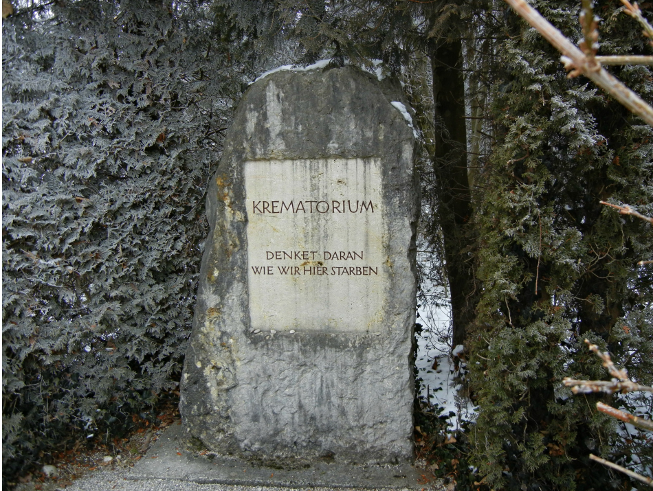
Figure 2: Crematorium entrance at Dachau.

The same might be said more generally about tragic narratives and their accompanying indicia. Awareness impacts viewers acutely. This is especially evident in Holocaust memorials, where the ghastly artifacts, and the unfathomable story lines, are intrinsic to their aesthetic power. 3