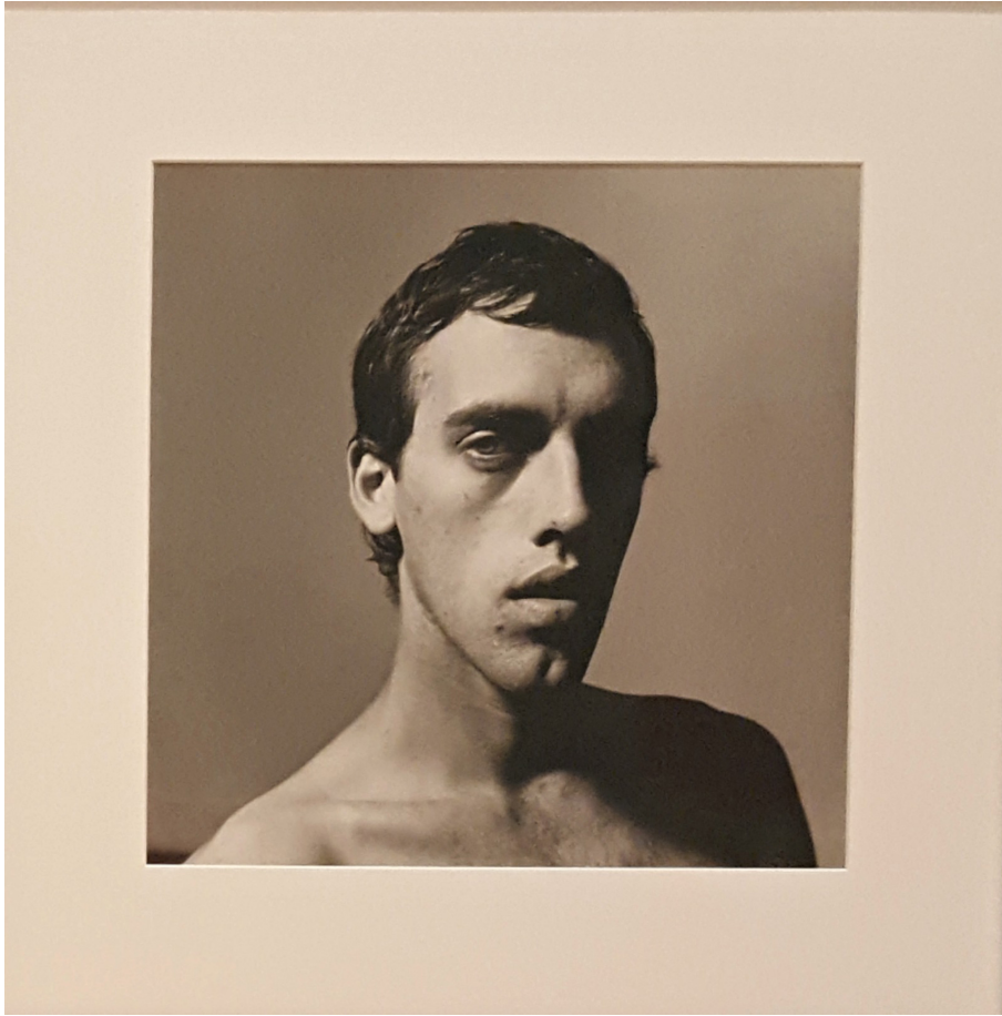
Figure 3: David Wojnarowicz, Peter Hujar, 1981. Photo by Paul R. Abramson, 2019

Yet, when Wojnarowicz needed to be discreet, his testimony in his civil lawsuit for instance, he was capable of describing the explicit sexual imagery in his 1989 painting Bad Moon Rising with sensitivity and aplomb. Wojnarowicz was clearly a young man of prodigious talent, fueled by a complex emotional palate, and a long history of severe trauma.