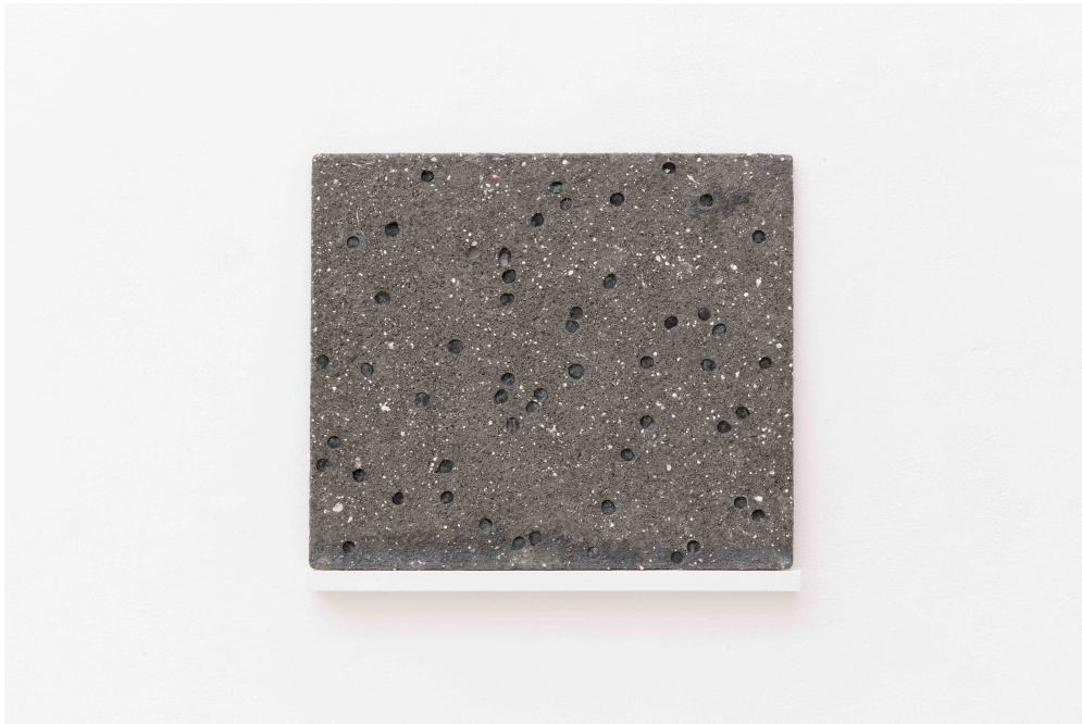
Figure 7: Jack Vickridge, Untitled , 2016, Concrete and pigment, 44.5 x 38.5 x 1cm.

The particular instruction ‘Time Painting’ which I selected for the A.P.T exhibition was realised originally by Ono for an exhibition in 1961 at AG Gallery as part of a series of ephemeral artworks. 13 This leads me to propose that whilst the work endures in the conceptual proposition to fully follow the artist in her train of thinking it is permissible to attempt to realise the instruction: to think through making. It is hoped that by undertaking this challenge alongside 13 other invited artists the visual outcomes will not come to illustrate the Ono instruction, but instead exist as part of an incomplete series of responses, showing the multiplicity of possible interpretations and exploring the ways in which the Ono instruction may exist within new paintings.