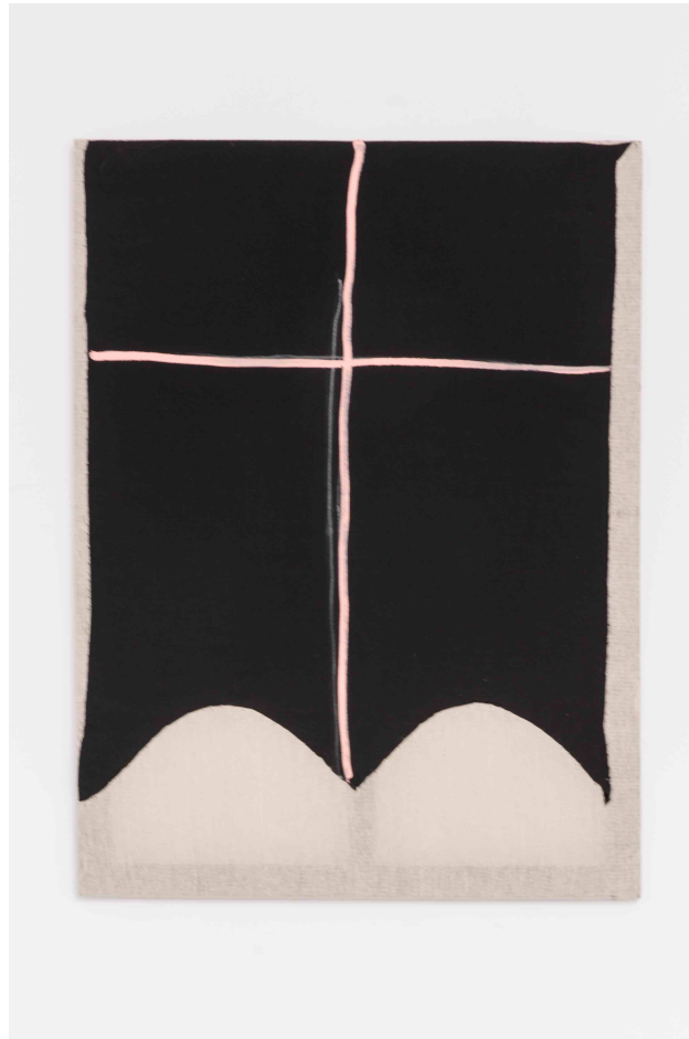
Figure 4: Sarah Pettitt, Sunset , 2016, Dust sheet, cotton, acrylic and chalk, 100 x 65cm.

problems'. 6 This work is at once a conceptual gesture, and a material process which has been documented, creating a specific visual form for the artwork. Consequently it can be said to anticipate the use of linguistic proposition that comes to characterise Conceptualism as it emerged in the 1960s and yet it can still be situated within a tradition of representational art, as the outcome of the instruction has been documented through both photography and painting by Suzanne Duchamp. 7 This representation of Unhappy Readymade extends the communicative potential of the instruction from a conceptual gesture to a form of dialogue between Marcel and Suzanne Duchamp, and this raises the question of whether Suzanne's response exists within the original conceptual gesture, or whether the visual form of the work exceeds the command of the instruction and exists as an artwork in its own right? This is perhaps answered by the way the photographic representation is presented within the collection of the Philadelphia Museum of Modern Art. 8 Labelled as 'Marcel Duchamp's Unhappy Readymade ', and attributed to Suzanne Duchamp,