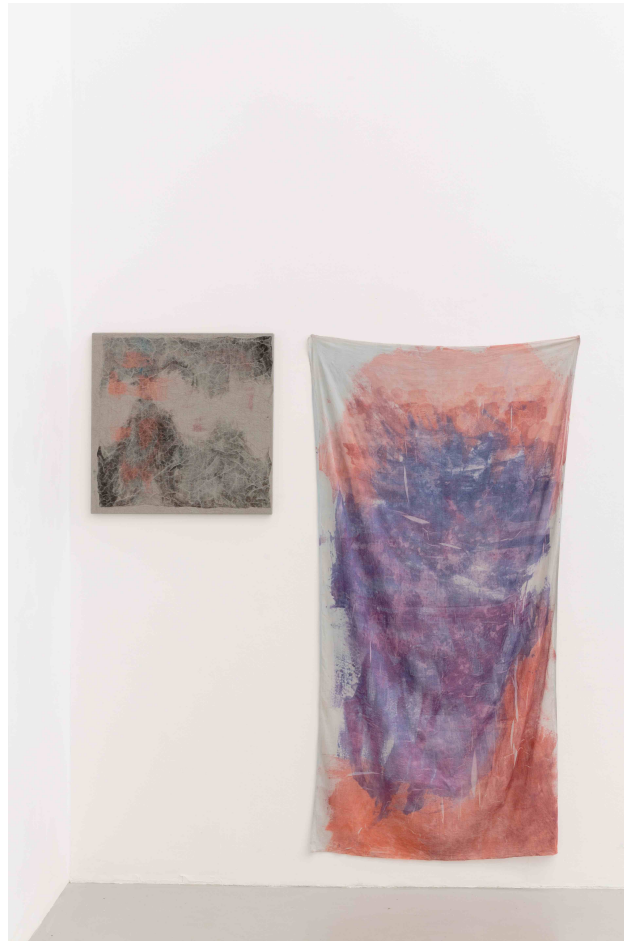
Figure 12: Sarah McNulty, Gram (Noon) , 2016, Sun-reactive paint on cotton, 100 x 200cm. Shrink (Noon) , 2016, Sun-reactive paint and ink on linen, 70 x 70cm.

presentation. Whilst the use of text encourages a reading of these paintings as instructive it is arguable that other works in this exhibition command the viewing subject through the specific nature of their form. For instance, the compressed form of Jo McGonigal's Lean painting (figure 9) could be said to instruct the viewer to adopt an awkward or unusual viewing position, pressing themselves against the wall in a way that mimics the painting and is arguably only sustainable for a brief period of time.