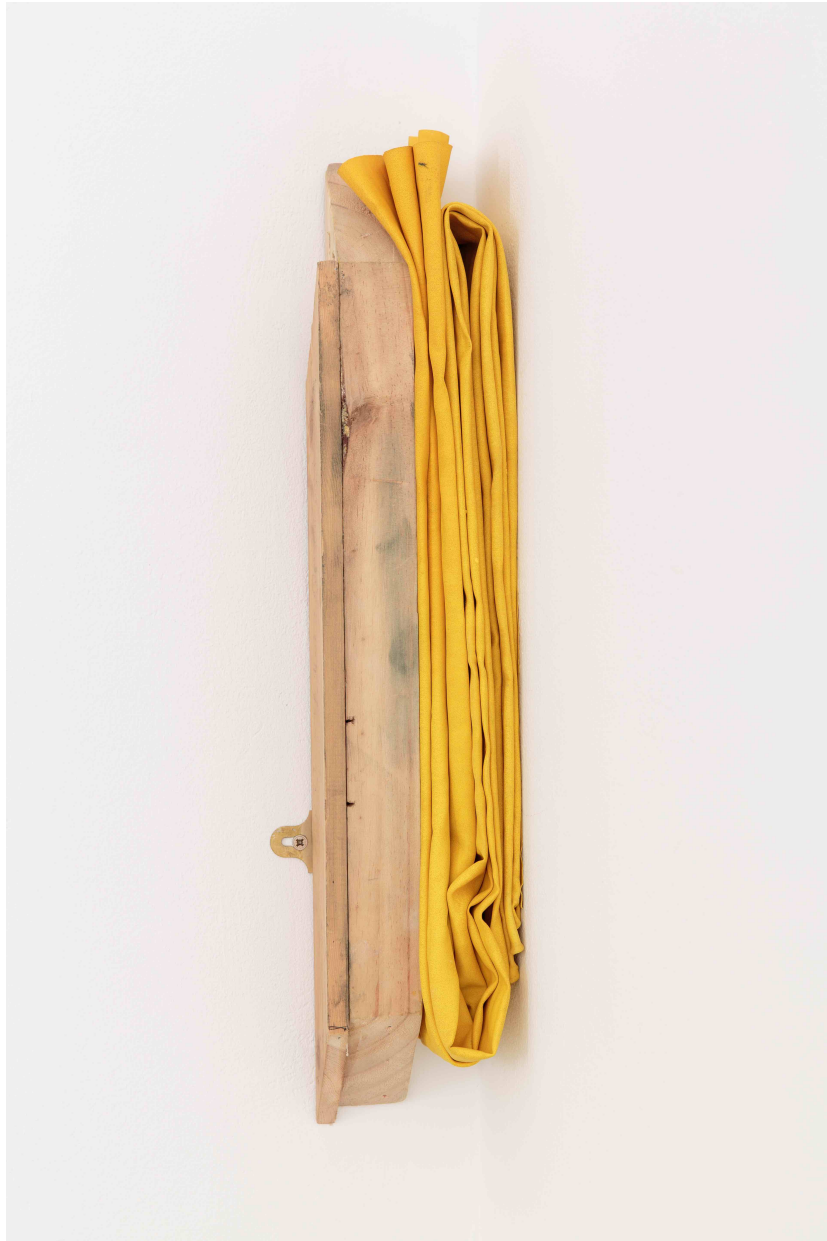
Figure 9: Jo McGonigal, Lean (Yellow) , 2016, wood, lycra, pigment. 58 x 11.5cm.