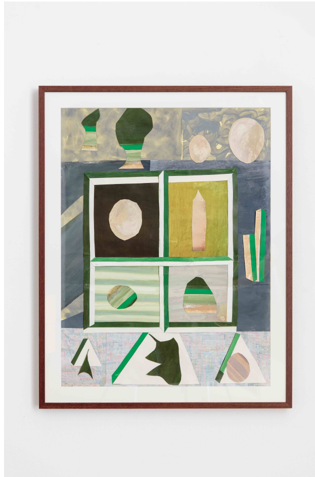
Figure 5: Kieran Drury, Take the first left hand , 2016, Acrylic and oil on paper, 90 x 67cm.

the description acknowledges both parties whilst maintaining a clear sense of hierarchy, which indicates that this photograph is to be understood as documentation of a conceptual artwork. The problem the Unhappy Readymade appears to have chosen is that the co-existence of the original instruction and later visual documentation may position the photograph (and later painting) as a form of illustration, whilst the linguistic instruction may also be reduced to a description of the particular circumstances which produced the visual form, arguably leaving little opportunity for the potential future viewer to engage imaginatively with the artwork.