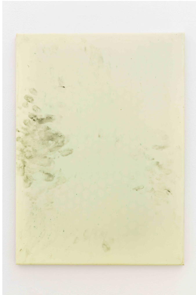
Figure 2: Damian Taylor, Untitled (paw) , 2016, Pigmented resin, glass fibre, honeycomb aluminium, 48 x 35cm. Untitled (pour) , 2016, Pigmented resin, glass fibre, honeycomb aluminium, 48 x 35cm.

Conceptualism, the assertion that art should not be judged primarily on its visual, sensory qualities but instead in terms of the concept that the material form expresses. Yet it can be argued, as Lucy Lippard demonstrated as early as 1968, that defining conceptual art through oppositional terms may situate Conceptualism within a trajectory of modernist painting. Lippard writes,