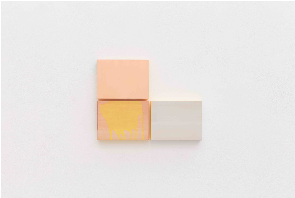
Figure 8: Jane Bustin, Yellow patch (arrangement) , 2016, Oil, acrylic, copper, wood. Triptych 30 x 40cm overall.