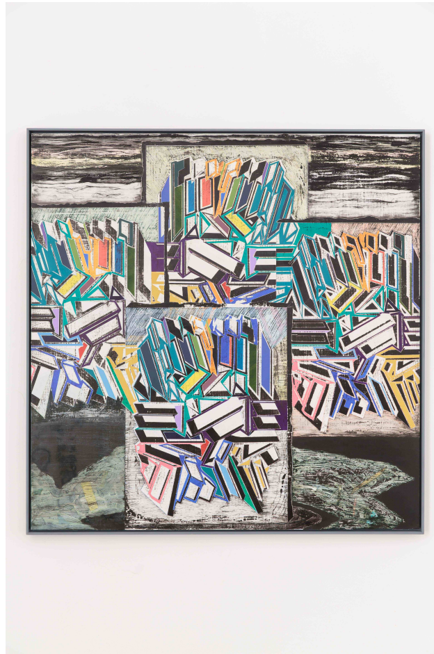
Figure 3: Ben Jenner, B[3F+1R] in landscape , 2016, Pencil, gesso, acrylic paint on wood. 151 x 147.5cm.

attention to the various ways in which an attitude of self-reflexivity towards art production may be expressed: an orientation towards visual or non-visual language and the positioning of material as primary or secondary in the production of meaning.