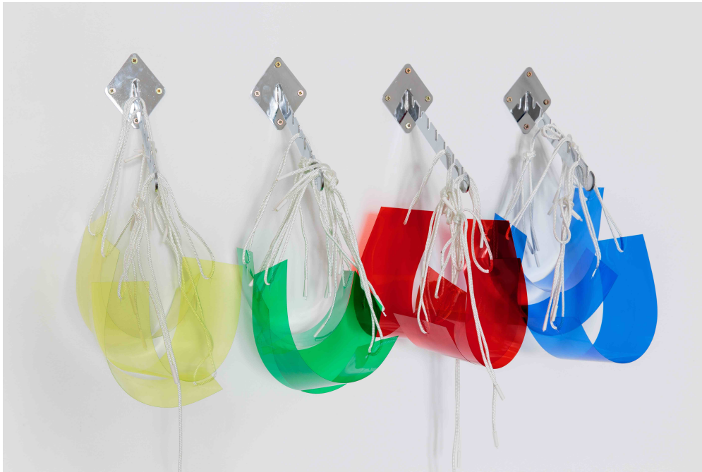
Figure 11: Sarah Kate Wilson, Visors , 2016. Coloured plastic, cord, clothing hangers, Dimensions variable.