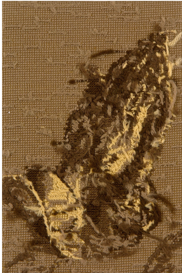
Figure 6: Rob Scholte: Praying Hands (Embroidery).

stitch, then the next, and so on. This requires dedication, but not genius. It is as simple as ABC.