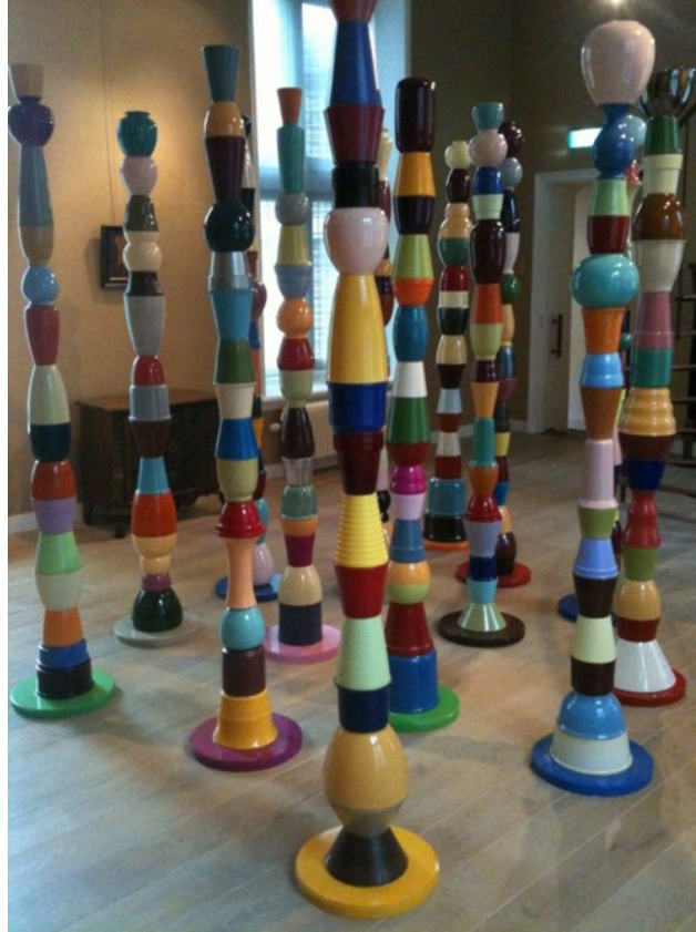
Figure 4: Rob Scholte: Pots. 2008

one also realises how these images blend in with art history: with the colour experiments of the likes of Goethe, Itten, Kandinsky or Peter Struycken (and with rainbows). They are not naive images—no matter how vulnerable they are in their everyday smallness. This series is called Made in China , the political economic dimension is clear—as I said, this is not my subject matter.