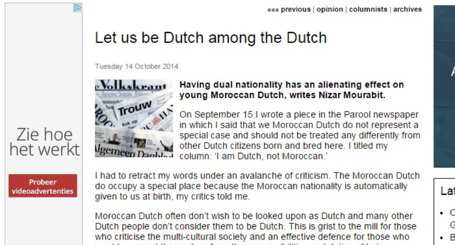
Figure 6: Nizar Mourabit