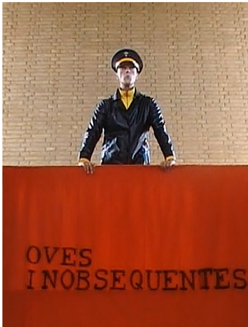
Figure 5: Oves Inobsequentes

In 2014, I started working on a fascist art movement by the name of Oves Inobsequentes (Latin for 'Disobedient Sheep'). 11 Founded in 1664, in remembrance of Carel Fabritius—the only student of Rembrandt to openly distance himself from his former teacher—it is the oldest art movement in existence. To its members, Fabritius was the first artist to declare himself to be autonomous by standing up to Rembrandt.