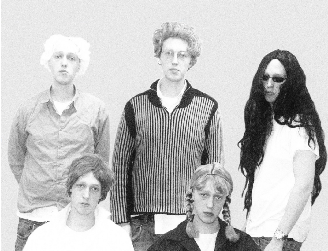
Figure 7: Ultrapopart, 1958