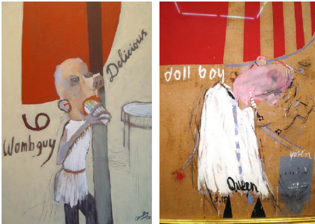
Figure 2: Conrad Boy: Womb Guy v. Doll Boy (David Hockney)